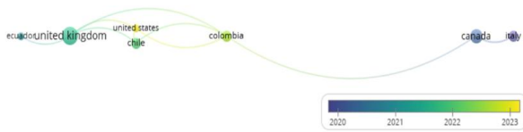
Figure 3. VOSViewer analysis countries involvement during the period 2020-2025

are in yellow. The United Kingdom, Ecuador, and the United States contributed to earlier research, and Canada and Italy emerged in the later period. The findings indicated a progressive expansion of research collaboration over time. These are presented in Figure 3 .